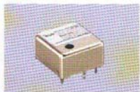
CR-293 HIGH STABILITY CRYSTAL UNIT Frequency stability: ± 0.5 ppm at 0°C to +60°C