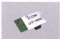
UT-102 VOICE SYNTHESIZER UNIT Provides audible confirmation of an accessed band's frequency.