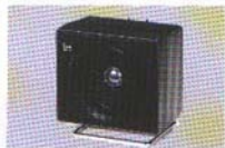
SP-7 EXTERNAL SPEAKER Input impedance: 8 Ω Max. input power: 5 W