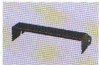
IC-MB12 MOBILE MOUNTING BRACKET Receiver mounting bracket for mobile operation.