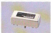
FL-52A CW NARROW FILTER Center freq.: 455 kHz Bandwidth: 500 Hz/-6 dB