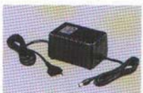
AD-55/A/V AC ADAPTER Allows you to power the receiver via domestic AC.