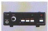
TV-R7100 TV/FM ADAPTER For TV broadcast reception and FM stereo reception.