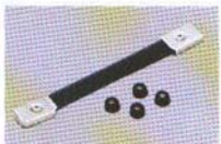
MB-23 CARRYING HANDLE For easy portable operation.