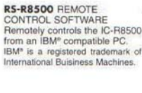
RS-R8500 REMOTE CONTROL SOFTWARE Remotely controls the IC-R8500 from an IBM® compatible PC. IBM® is a registered trademark of International Business Machines.