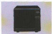
SP-21 EXTERNAL SPEAKER Input impedance: 8 Ω Max. input power: 5 W